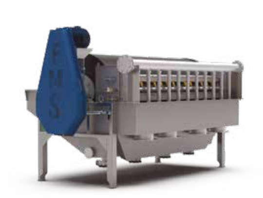
Wet Magnetic Seprator