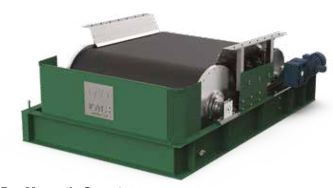
Dry Magnetic Seprator